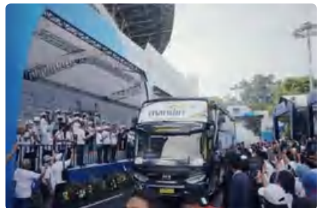
Bung Karno, in collaboration with the Ministry of State-Owned Enterprises and the Ministry of Religious Affairs Office.

In facilitating the healthy homecoming journey with SOE on April 16-19, 2023, Bank Mandiri effectively assisted 7,000 travelers at the PBNU Office, TNI Headquarters Cilangkap, and Gelora