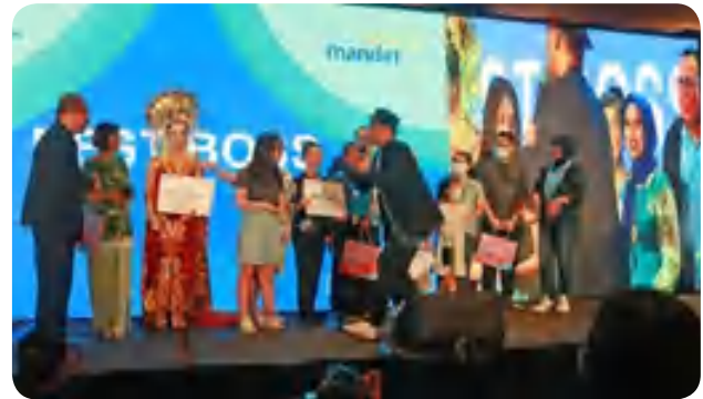
Young Entrepreneur (WMM) and Rumah BUMN alumni to provide continuous mentoring and training to selected PMI and PMI families.

Training for PMI is carried out offline and online by gathering PMI from several countries such as: Hong Kong, Singapore, Malaysia and UAE. Apart from offline training and online, the Foster Father Program was also held in synergy with the Mandiri